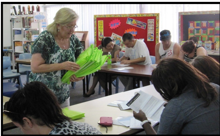
2015 Kindy parents receiving their Better Beginnings reading packs.